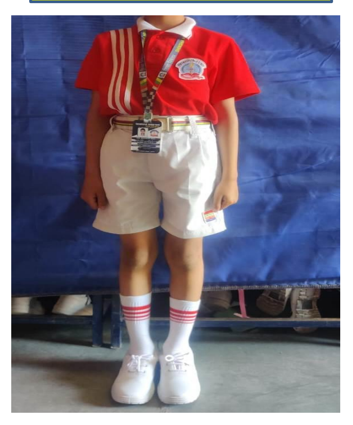
CLASS 3<sup>RD</sup> AND 4<sup>TH</sup> (BOYS UNIFORM)