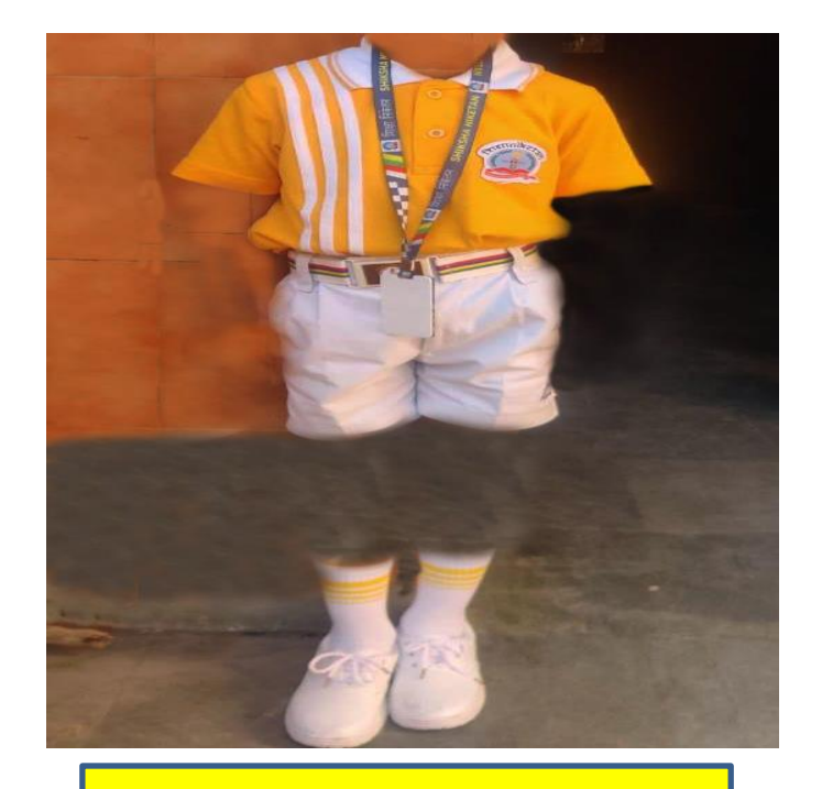
CLASS 1<sup>ST</sup> AND 2<sup>ND</sup> (BOYS UNIFORM)