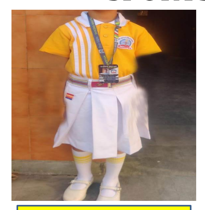
CLASS 1<sup>ST</sup> AND 2<sup>ND</sup> (GIRLS UNIFORM)