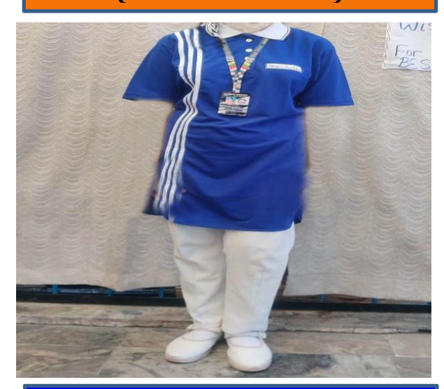
CLASS 8<sup>TH</sup> TO 10<sup>TH</sup> (GIRLS UNIFORM)