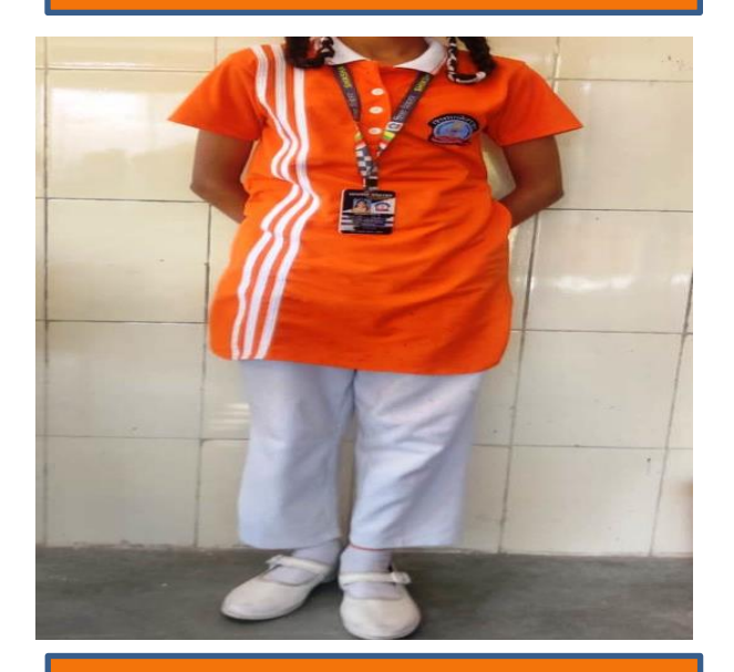
CLASS 6<sup>th</sup> AND 7<sup>TH</sup> (GIRLS UNIFORM)