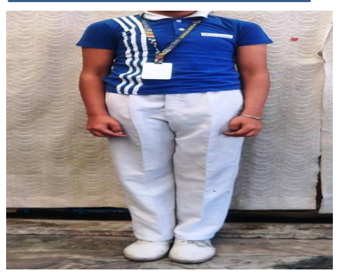
CLASS 8<sup>TH</sup> TO 10<sup>TH</sup> (BOYS UNIFORM)