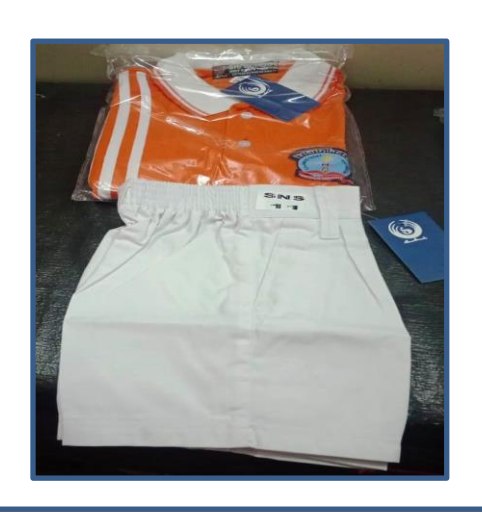
CLASS 5<sup>TH</sup> (BOYS UNIFORM)