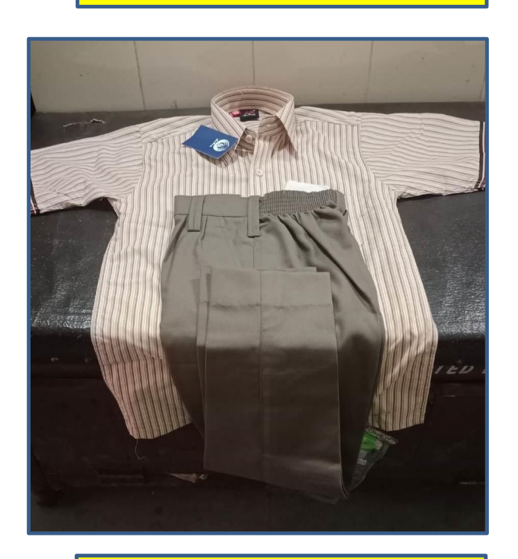
CLASS 6 <sup>TH</sup> TO 10 <sup>TH</sup>