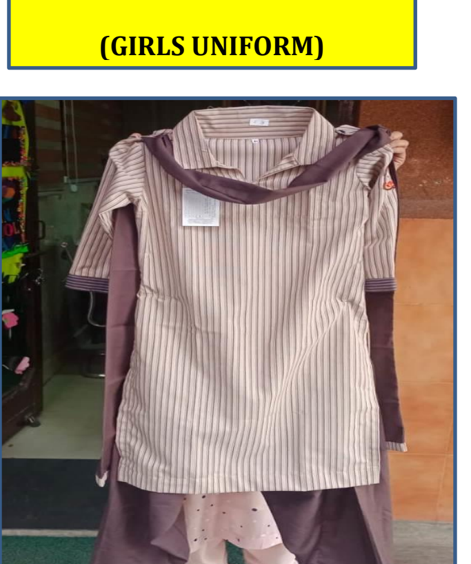
CLASS 6 <sup>TH</sup> TO 10 <sup>TH</sup>