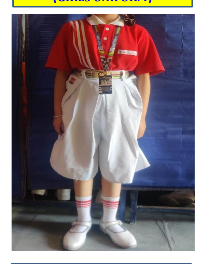
CLASS 3<sup>RD</sup> AND 4<sup>TH</sup> (GIRLS UNIFORM)