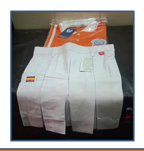
CLASS 5<sup>TH</sup> (GIRLS UNIFORM)